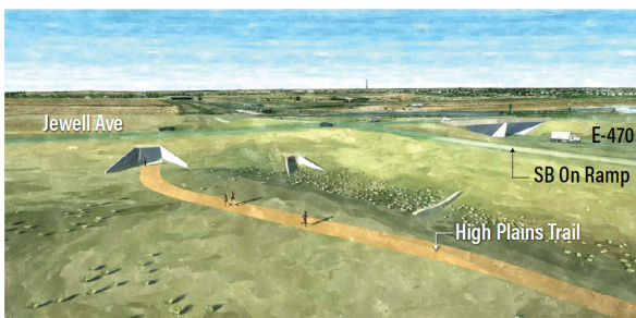
HIGH PLAINS TRAIL RENDERING