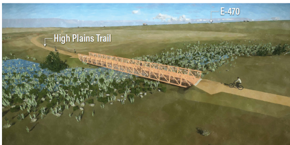
HIGH PLAINS TRAIL AND BIKE/PEDESTRIAN BRIDGE RENDERING